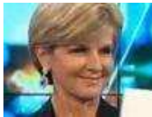
Bishop reveals equality stance