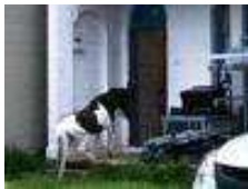
Harley the horse gets shown the door