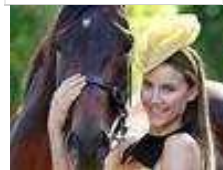
Cup tips: Our experts' selections for the great race

The high prevalence of violence is matched by an equally pervasive silence, with victims still reluctant to confide to anyone about their ordeal.